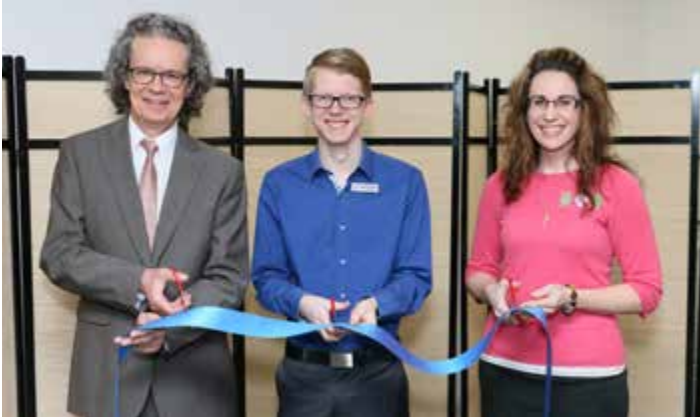
The multi-faith space was officially opened Mar. 26.