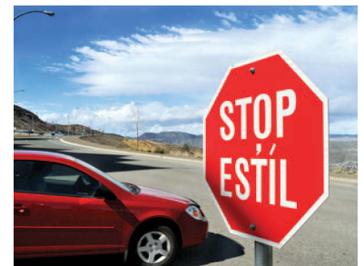
This is one of many stop signs on campus that has on it the Secwepemc People's word for "stop". A newly-created Secwepemctsin language course started on Jan. 21.