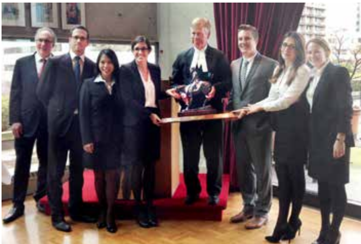
TRU Law's first win in the BC Appeal Moot Court.