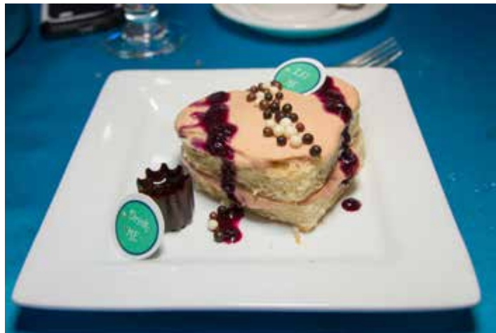
A delicious dessert to top off the TRU Foundation Gala.

Over 600 high school students visited TRU on Feb. 19 to participate in Junior Achievement BC's Economics for Success program, which encourages students to explore their post-secondary and career goals.