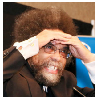
American philosopher, political activist, author, and university professor Dr. Cornel West views his audience.