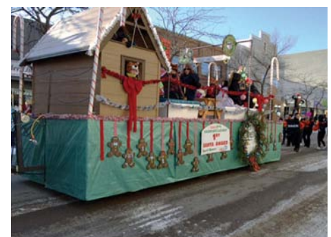
The Trades and Nursing Santa Claus Parade Float won first place.