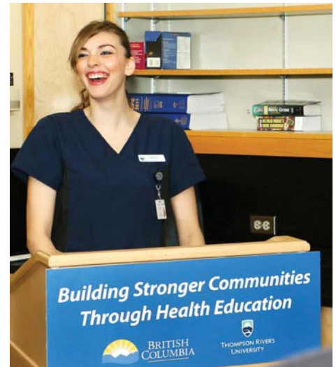
TRU received provincial funding of $365,000 to open 43 new Health Care Assistant seats in 2015.

http://inside.tru.ca/2014/11/28/wldcu-donates-to-health-centre/