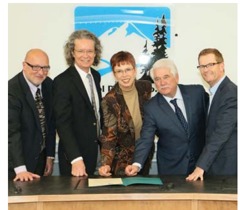
TRU and SD 73 will offer dual credits in trades "sampler" courses at NorKam Trades and Technology School.