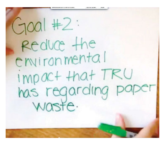
Apply now to the Sustainability Grant Fund for sustainability-related initiatives or research