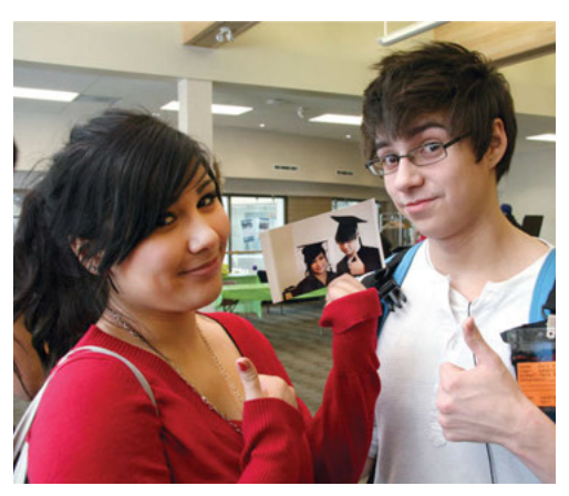
TRU's annual Transitions to Post Secondary Day familiarized Aboriginal high school students with university life.