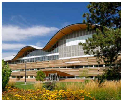
Old Main, winner of the SCUP/AIA 2014 Honour Award of Excellence.

The School of Trades and Technology has partnered with Habitat for Humanity to help build, plumb and wire a duplex on Westsyde Road that will be the new home to two deserving families.