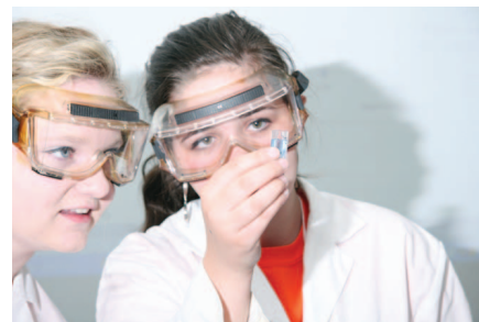
Grade 11 students participate in the hands-on portion of the High School Chemistry Contest, held at TRU on May 15.

http://inside.tru.ca/2013/04/22/tru_alertlaunched/