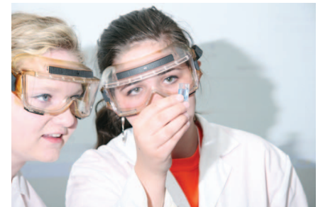
Grade 11 students participate in the hands-on portion of the High School Chemistry Contest, held at TRU on May 15.

www.tru.ca/science/programs/chemistry/chem_contest