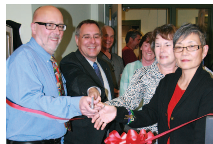
Celebrating the makeover in the Registrar's Office

Staff in the Registrar's office celebrated the makeover of their workspace on April 10. The consultative process to redesign the space has improved the former trades area's acoustics and functionality.