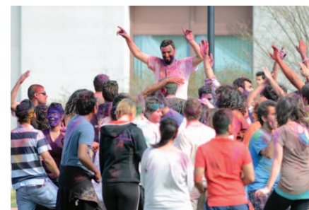
Rang De Basanti

www.flickr.com/photos/thompsonrivers/8632602586/in/photostream