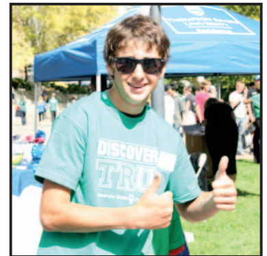
About 1,000 students took part in Orientation for first-year students on Sept. 4. The day involved a simulated convocation, meeting faculty, a resource fair, and free BBQ.