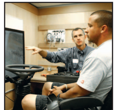
A student (sitting) learns more about TRU's heavy equipment simulator during a media conference in August to announce that Great West Equipment in Vernon has committed $373,000 towards heavy equipment training at TRU.