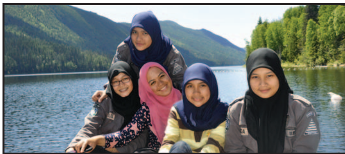
High school students from the International Islamic Education Council (IIEC) in Indonesia enjoy the scenery at North Barriere Lake in June. The students, part of a larger group of 190, were here for a month-long cultural immersion that included a range of on-campus and off-campus learning.