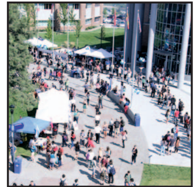
25th Annual Welcome Back BBQ

After a summer of dramatic changes (see photos of the roof construction here www.flickr.com/photos/thompsonrivers/sets/72157630320200062/ ) and challenges due to weather, faculty and staff moved back into their offices in Old Main at the end of August and