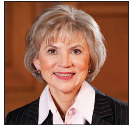
The Right Honourable Beverly McLachlin, PC, Chief Justice of Canada