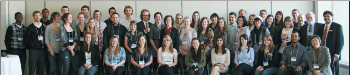
TRU's outstanding students in academics, leadership in school and community, and athletics at the Major Scholarship Reception held in their honour.