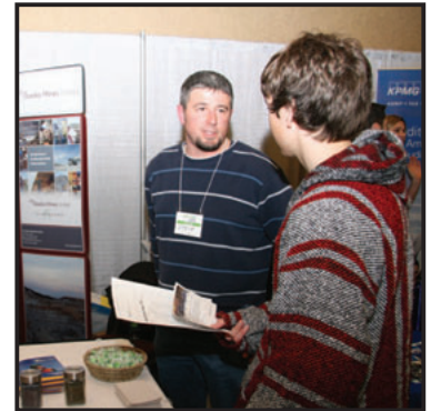
Recruiters from 50 different companies participated in the 2012 Job Fair