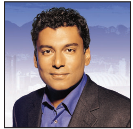
Ian Hanomansing speaks on "Five Things that Make Canada Great that Most of Us Take for Granted" at the 2012 DAA Awards