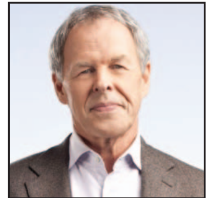
Linden MacIntyre of the CBC's Fifth Estate will be giving a lecture on April 2 on "Sexual abuse and the media"