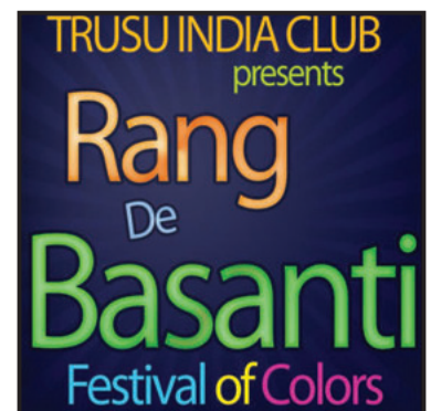
400 people attended this year's celebration of three Indian Festivals at Rang de Basanti