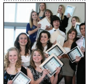
12 local secondary school students earn a TRU scholarship, an iPad and Smart boards