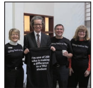
Giving Back to TRU