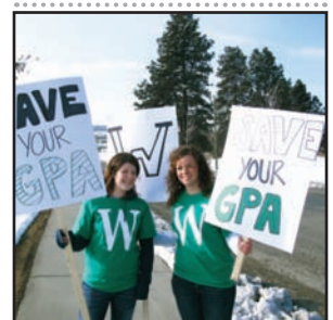
The "W" Campaign