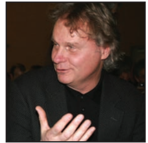
The latest President's Lecture Series featuring Wade Davis