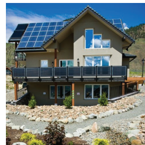
2010 Green Dream Training House

Another honour for the ST&T along with their partner the Canadian Home Builders Association Central Interior. The 2010 Green Dream Training House project was named second runner-up at the 2010 Insulated Concrete Form (ICF) Builder Awards in Las Vegas in the Residential, Large division category. More than 40 entries from through out North America competed in the category.