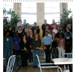
Student Leadership Celebrated