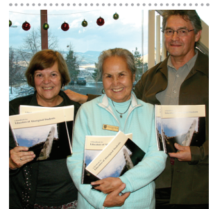
A Handbook for Educators of Aboriginal Students