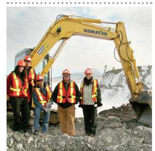
Women Explore Trades Through Practical Training