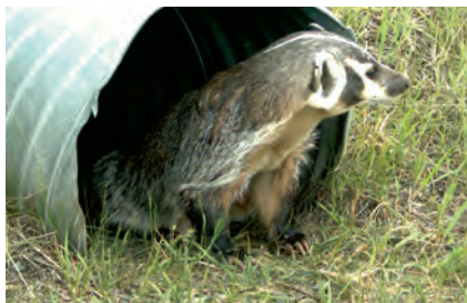
All 300 of Canada's surviving badgers live in BC.