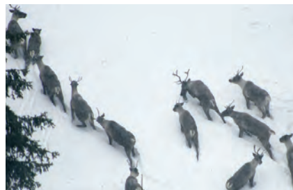
Data collected from caribou radio-collared in 1989

Ultimately, Huebel hopes to determine if helicopter activity disturbs the caribou, either causing them to avoid preferred areas or to move away from preferred areas while helicopters are in the area.