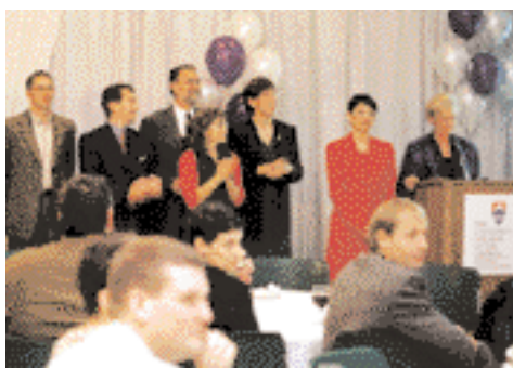
Alumni and faculty socialize at the President's Reception