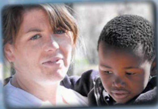
Lesotho, South Africa (Nursing)