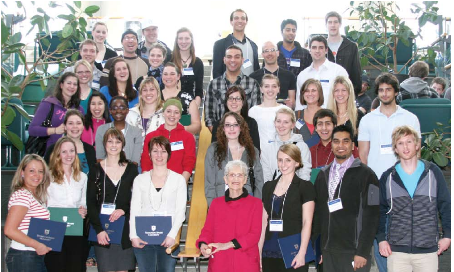
These students were among the top 10 from each school and faculty invited to the Alvin & Lydia Grunert Scholarship reception in March.

To recognize and foster academic achievement, TRU launched a major new annual award, seven scholarships valued at $5,000 each, offered to the top nominee from each faculty and school and one athlete. More than 900 top TRU students met the scholarship's Fall criteria. Of those, only the top 10 from each area were selected, for a total of 70 nominations.