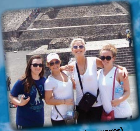
Mexico (Modern Languages)