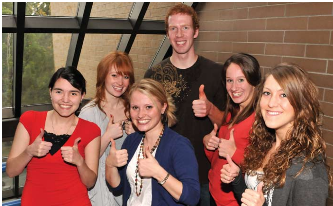
TRU collected six Natural Sciences and Engineering Research Council (NSERC) of Canada scholarships this year—a prestigious number for sure.

"I would like to offer my sincere congratulations to the scholarship recipients from Thompson Rivers University. This achievement is a testament to your hard work and dedication and the high calibre education you have received from TRU," Cathy McLeod, MP for Kamloops–Thompson–Cariboo.