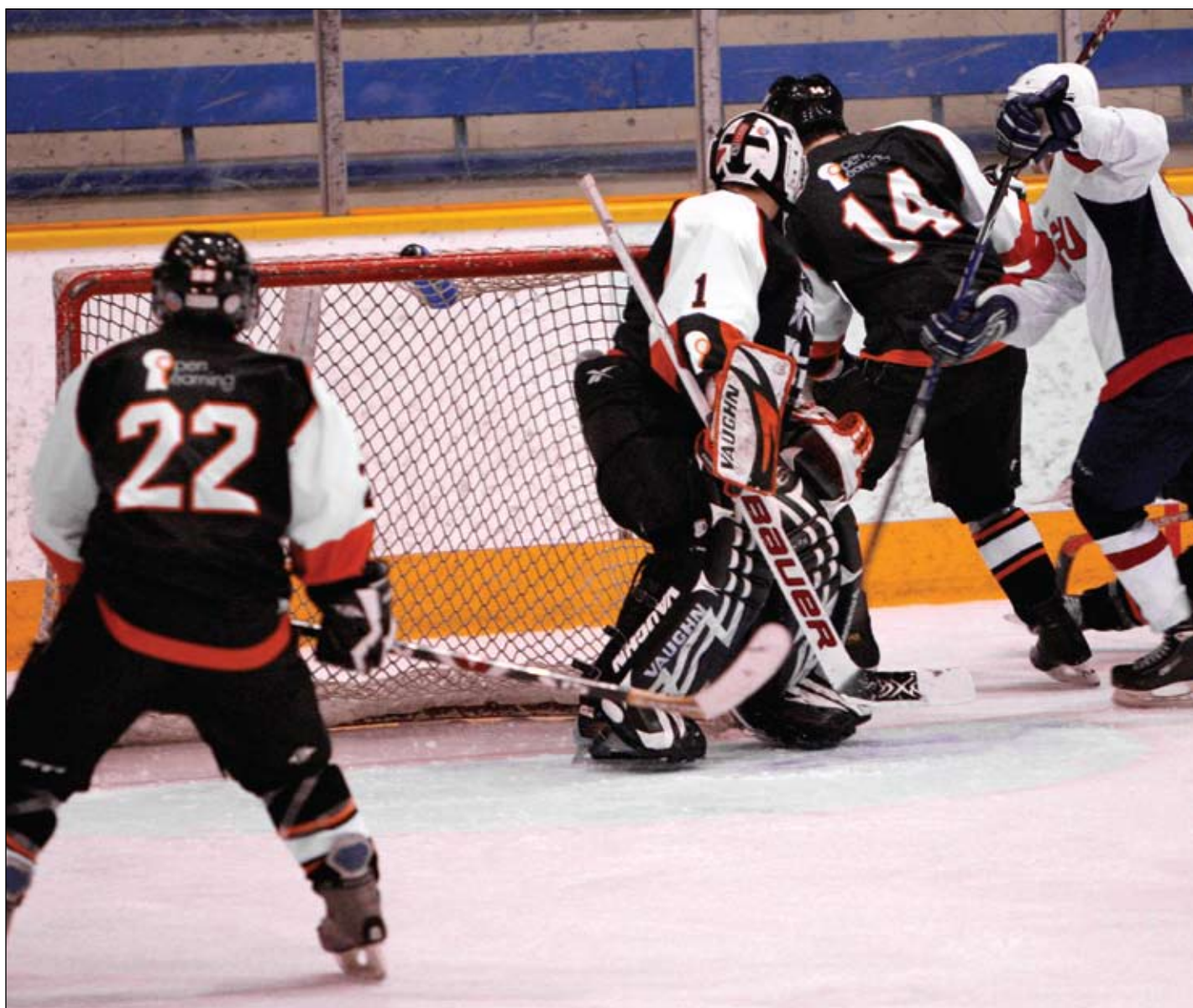
Ice hockey made a triumphant return to TRU in 2009-10. Playing their home games out of Memorial Arena, the TRU Open Learning WolfPack became a Saturday night tradition en route to finishing second in the BC Intercollegiate Hockey League.

Looking ahead to next year, the TRU family is expected to grow to 11 sports with the addition of cross country running.