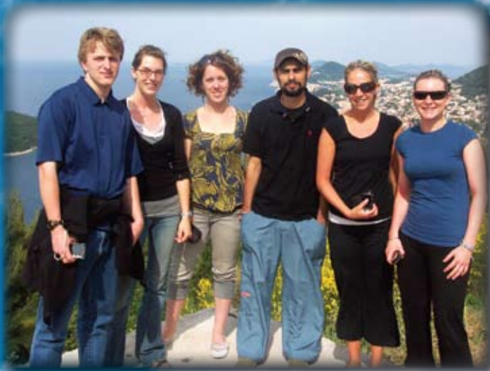
Eastern Europe (Anthropology/Sociology)