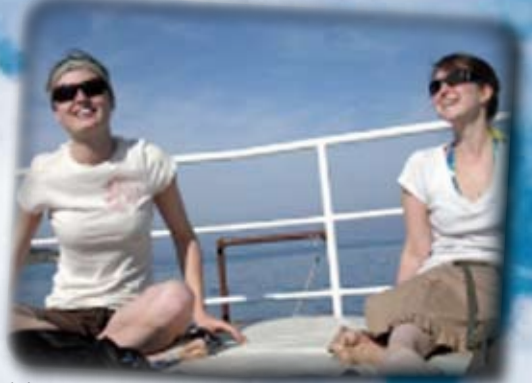
Philosophy in the Aegean (Philosophy)