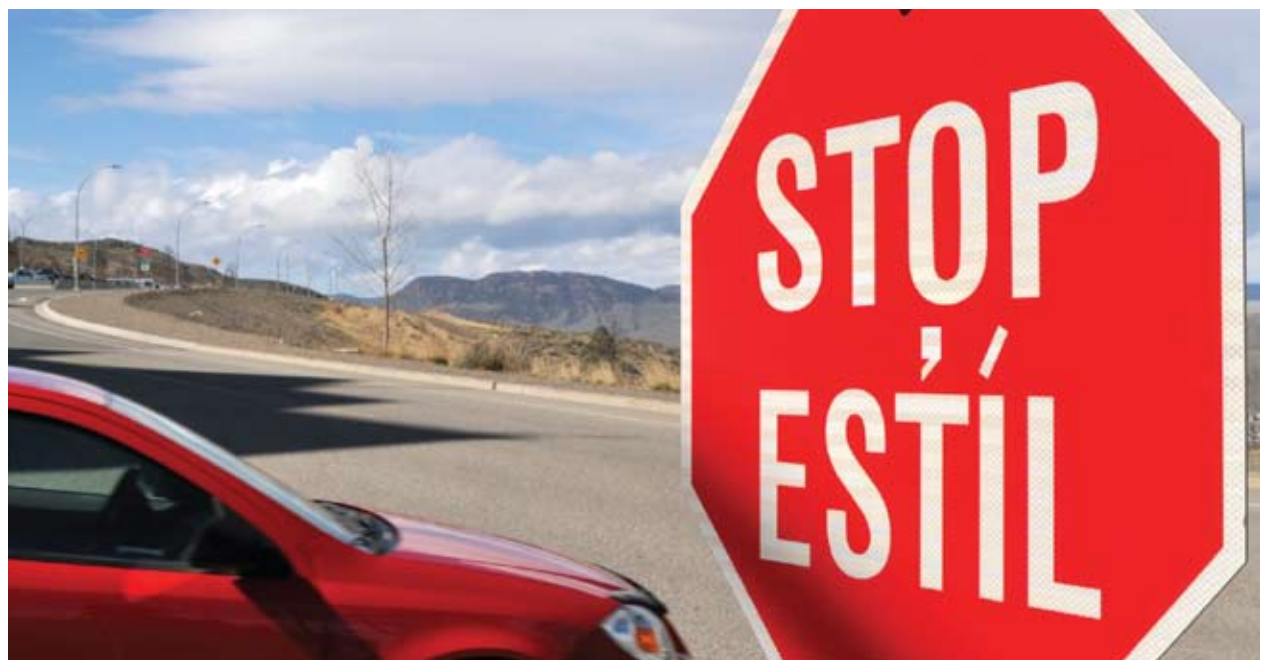
Estil is Secwepemctsin for stop. There are 33 of the signs on the Kamloops campus.

Kamloops to meet with representatives from the University and the community. He also took the time to meet with Canadian students who have studied in China and Chinese students studying at TRU.