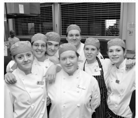
Culinary Arts students head to Whistler

http://scope.bccampus.ca/course/view.php